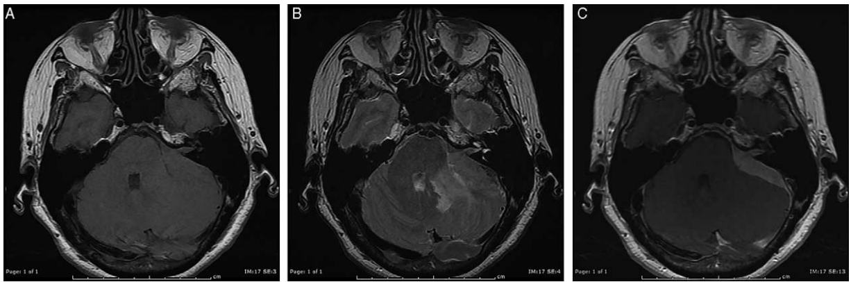
FIG. 1. Preoperative brain MRI axial images. A , T1-WI demonstrates an isointense to gray matter signal—intense dural-based mass at the left CPA extending into and filling the internal auditory canal. The mass exerts a mild degree of mass effect on the brachium pontis. B , Fast spin echo T2-WI demonstrates the mass to be isointense (note the hyperintense signal within the brachium pontis and the deep white matter of the cerebellum, which may represent edema). C , Postcontrast T1-WI shows homogeneous avid enhancement mass that appears to rise from and follow the dura along the CPA extending into the IAC. CPA indicates cerebellopontine angle; IAC, internal auditory canal; MRI, magnetic resonance imaging; WI, weighted image.